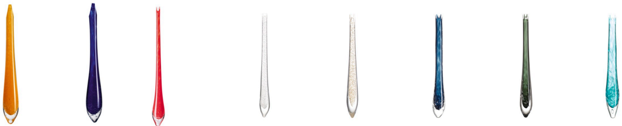
Yellow (13) Blue (09) Cherry Red (45) Silver (44) Gold (43) Dark Blue (42) Grey (41) Blue Sea (39)