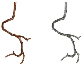
Copper (CO) Lead (CH)