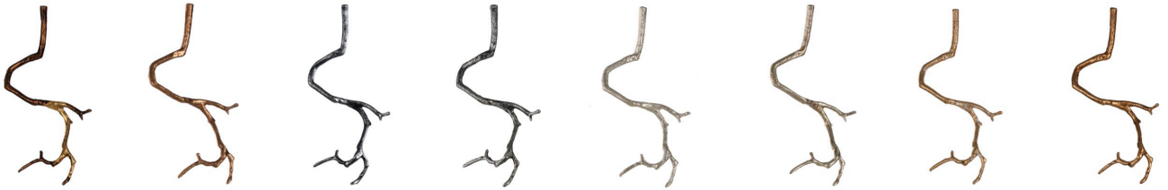
Talha (TA) Rose Gold (RO) Black (PR) Palladium (PL) Silver/White Patina (FP/PB) Silver (FP) Gold/White Patina (FO/PB) Gold (FO)