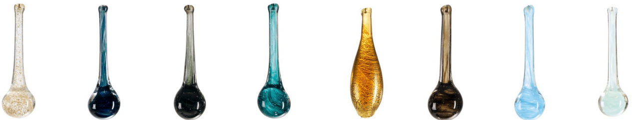
Gold (43) Dark Blue (42) Grey (41) Blue Sea (39) Amber Gold Leaf (36) Smoked (34) Turquoise (33) Water Blue (32)