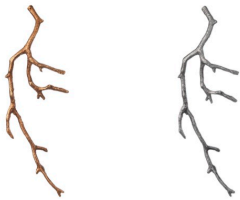
Copper (CO) Lead (CH)