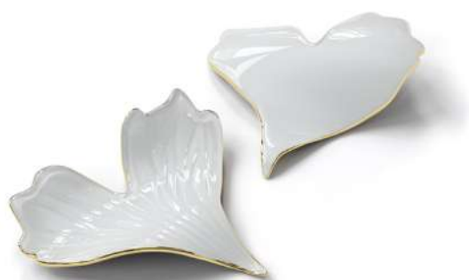
Crystal opal with gilded edges