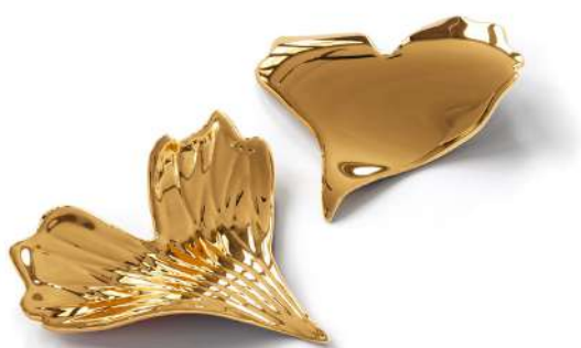
Crystal warm aurum