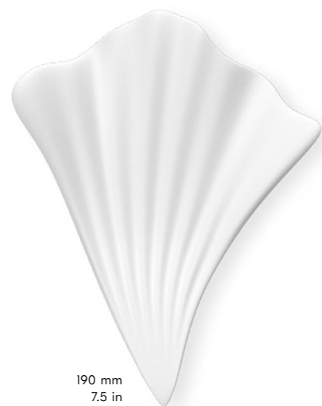
190 mm 7.5 in