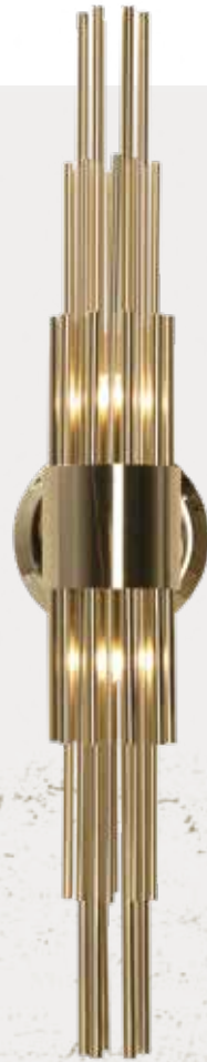
WALL LIGHT 9271.2

DIMENSIONS: H.66CM - W.9CM - D.17CM WEIGHT: NET 3,5KG BULBS: 2X G9 (MAX 28W) MATERIAL: BRASS