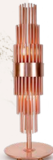
TABLE LAMP 9274.2

DIMENSIONS: H.70CM - Ø.20CM WEIGHT: NET 8KG BULBS: 5X G9 (MAX 28W) MATERIAL: BRASS