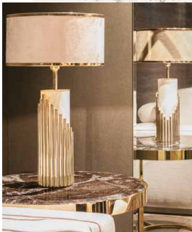
TABLE LAMP 9273.1

DIMENSIONS: H.67CM - Ø.25CM WEIGHT: NET 10KG BULBS: 6X G9 (MAX 28W) MATERIAL: BRASS