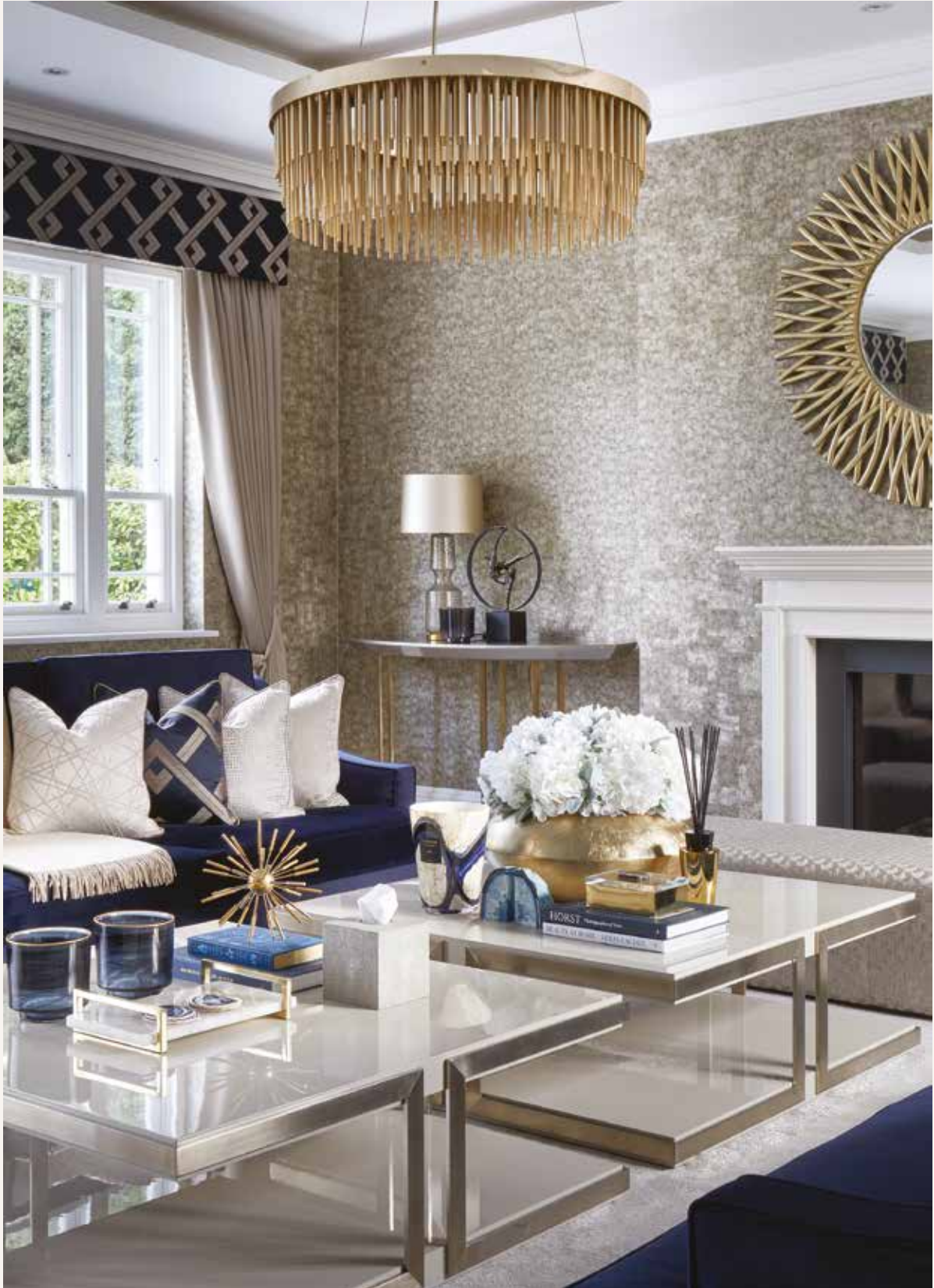
PROJECT BY: ALEXANDER JAMES INTERIORS, UK